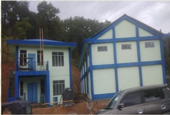
Darlawn Godown & Staff Qtrs.