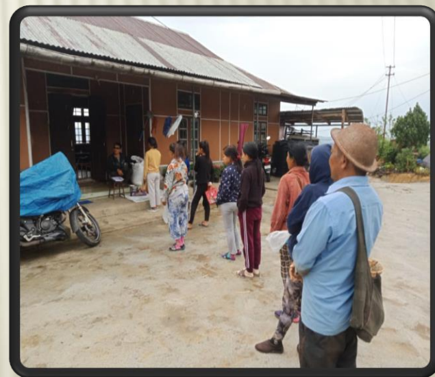
Distribution of Dal by retailer @ Reiek, Mizoram