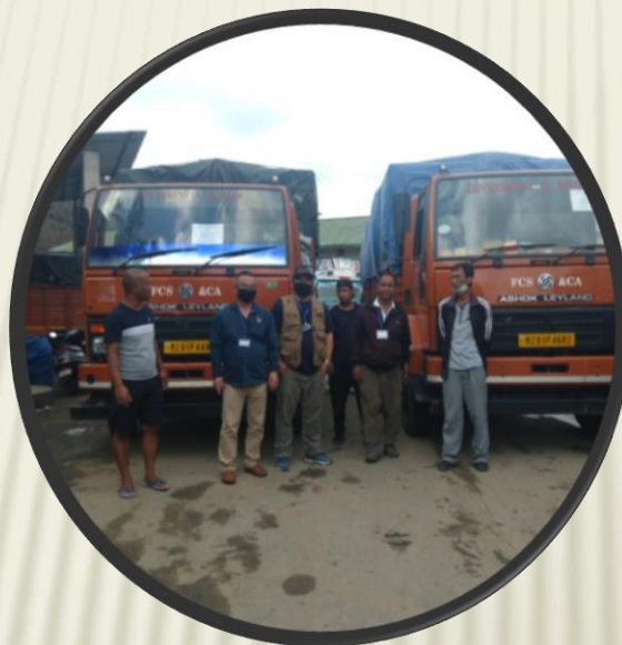
Receipt of Dal @ Central Godown, Aizawl