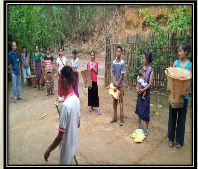
Queue for PM-GKAY rice @ Bungtlang South