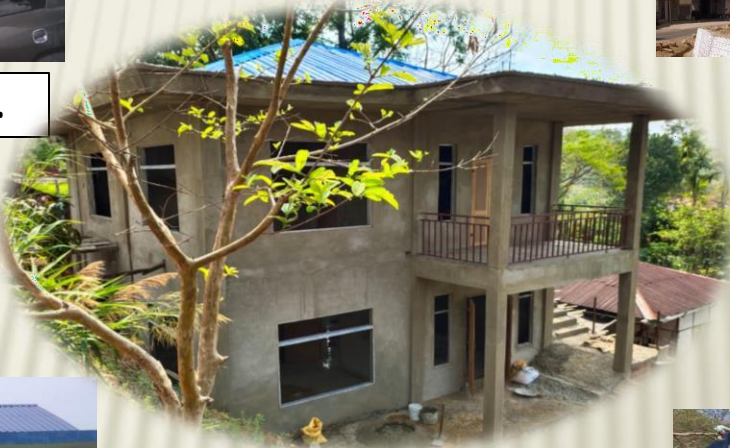
Kolasib Staff Qtrs.