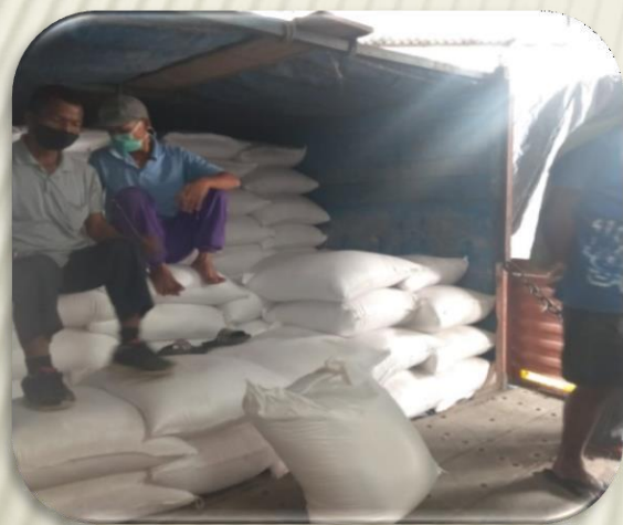
Receipt of Dal @ Central Godown, Aizawl

As a relief to the poor on account of COVID-19 pandemic, Ministry of CAF&PD, GoI has conveyed allocation of free pulses/dal to NFSA beneficiaries across the State at the scale of 1kg per household for 3(three) months i.e April to June, 2020 with a quantity of 155.405 MT per month. As of now, distribution of dal is being done in various Districts to NFSA beneficiaries ( AAY & PHH). Allocation for the month of April is received almost in full while allocation for the month of May & June, 2020 is also expected to be delivered within May, 2020. The total quantity allocated for the 3(three) months amounts to 466.215 MT for the State.