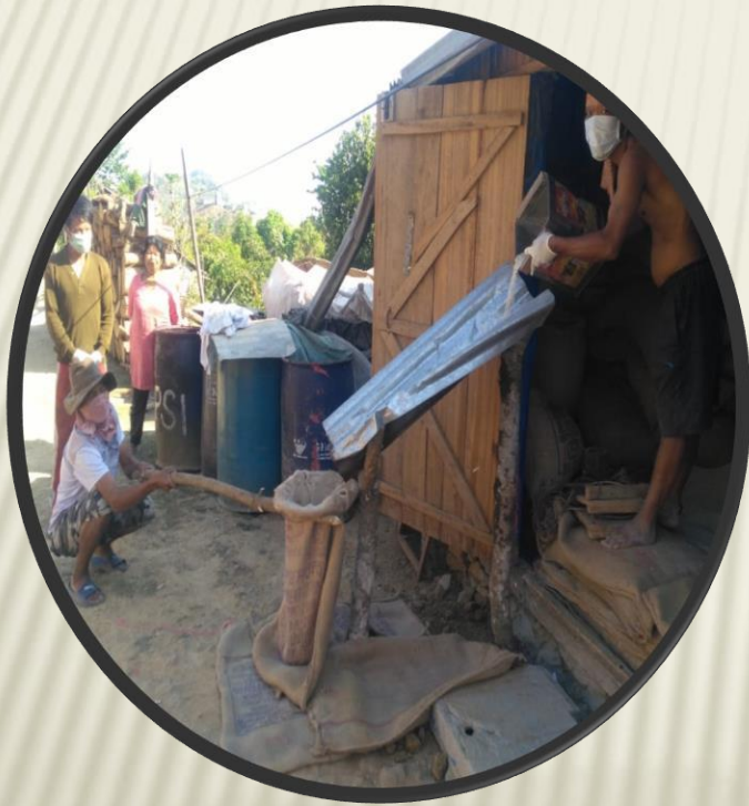
Distrbution of PM-GKAY rice

PM GaribKalyan Anna Yojana was launched across the nation as a measure to relieve the poorer section of the Society during Lockdown period due to outbreak of Covid-19 crisis. The State Government has implemented this programme in distributing free rice to all beneficiaries under NFSA, i.e AAY & PHH for the period of three months April, May and June 2020. The scale of distribution of rice is 5 kg per person per month for 155405 card holders with a total quantity of 100230.25 Qtls of rice. The Department of Food, Civil Supplies & Consumer Affairs has started this distribution of rice through Fair Price Shop from 24.4.2020.