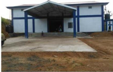
Thenhlum Godown, Capacity - 350 MT Amount : Rs. 1,26,71,340.00, Under DCSO Serchhip