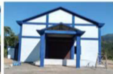
Putlungasih Godown, Capacity - 350 MT Amount : Rs. 1,26,71,340.00, Under DCSO Lunglei