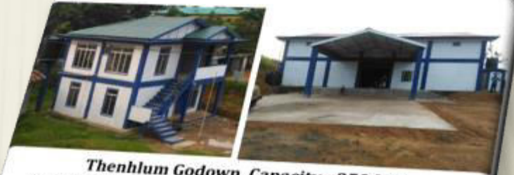
Thenhlum Godown, Capacity - 350 MT Amount : Rs. 1,26,71,340.00, Under DCSO Serchhip