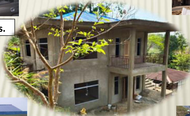
Kolasib Staff Qtrs.