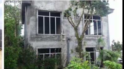
Phullen Godown, Capacity - 350 MT Amount : Rs. 1,21,50,600.00, Under DCSO Aizawl East