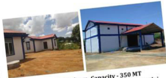
Vathuampui Godown, Capacity - 350 MT Amount : Rs. 1,27,87,060.00, Under DCSO Lawngtlai