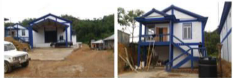
Buarpui Godown, Capacity - 350 MT Amount : Rs. 1,26,71,340.00, Under DCSO Serchhip