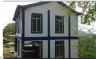
Damdep Godown Capacity - 250 MT Amount : Rs. 1,16,82,060.00 Under DCSO Lawngtlai

DCSO Lawngtlai Amount : Rs. 1,16,82,060.00