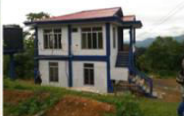
Bungmun Godown, Capacity - 350 MT Amount : Rs. 1,26,71,340.00, Under DCSO Serchhip