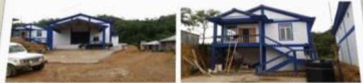
Buarpuil Godown, Capacity - 350 MT Amount : Rs. 1,26,71,340.00, Under DCSO Serchhip