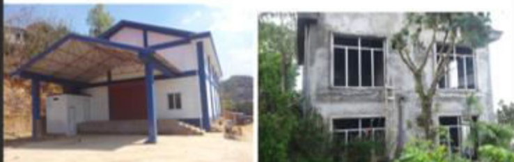
Phullen Godown, Capacity - 350 MT Amount : Rs. 1,21,50,600.00, Under DCSO Aizawl East