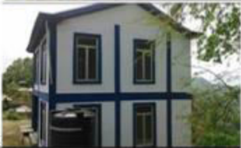
Damdep Godown Capacity - 250 MT Amount : Rs. 1,16,82,060.00 Under DCSO Lawngtlai