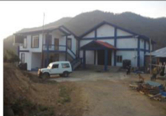
Suangpuilawn Godown, Capacity - 350 MT Amount : Rs. 1,21,50,600.00, Under DCSO Aizawl East