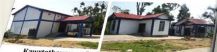
Kawrtethawveng Godown, Capacity - 350 MT Amount : Rs. 1,21,50,600.00, Under DCSO Mamit