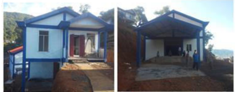
Zawngling Godown, Capacity - 350 MT Amount : Rs. 1,29,02,780.00, Under DCSO Saiha