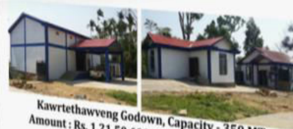
Kawrtethawveng Godown, Capacity - 350 MT Amount : Rs. 1,21,50,600.00, Under DCSO Mamit

အမှတ် : ၇၄- ၂၂၃-၂၂-၅၅၀-၀၀ ပရိယာယ် DCSO မြောက်ပိုင်း ပြည်နယ် ဝန်ထမ်း နေရာချုပ် - ၁၁၀ ယူအီ