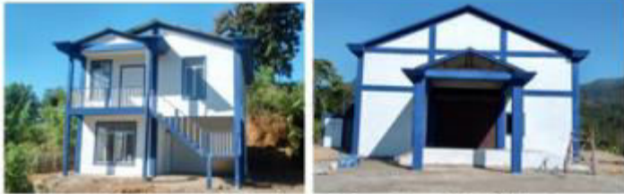
Putlungasih Godown, Capacity - 350 MT Amount : Rs. 1,26,71,340.00, Under DCSO Lunglei