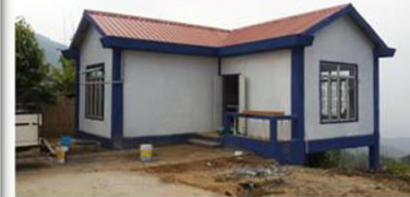
Khawlian Godown Capacity - 250 MT Amount : Rs. 1,11,00,600.00 Under DCSO Aizawl East