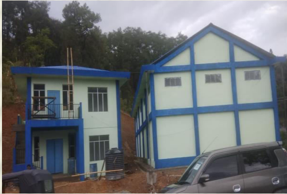
Darlawn Godown & Staff Qtrs.