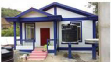
Vaphai Godown Capacity - 250 MT Amount : Rs. 1,14,70,620.00 Under DCSO Champhai