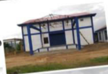
Diltlang Godown Capacity - 250 MT Amount : Rs. 1,16,82,060.00 Under DCSO Lawngtlai