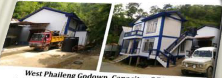
West Phaileng Godown, Capacity - 350 MT Amount : Rs. 1,21,50,600.00, Under DCSO Mamit