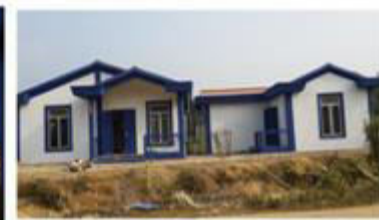
Silsuri Godown Capacity - 250 MT Amount : Rs. 1,11,00,600.00 Under DCSO Mamit