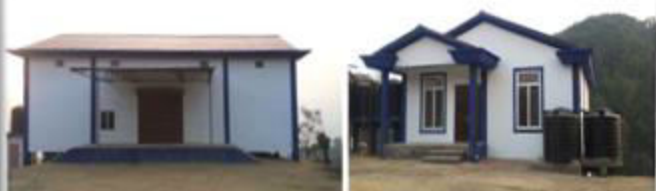
Kangmun Godown Capacity - 350 MT Amount : Rs. 1,21,50,600.00 Under DCSO Aizawl West