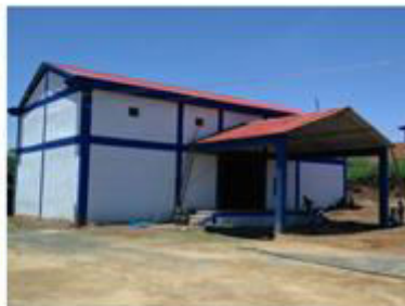
Vathuampui Godown, Capacity - 350 MT Amount : Rs. 1,27,87,060.00, Under DCSO Lawngtlai