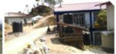
Lungpho Godown Capacity - 352 MT Amount : Rs. 1,25,55,620.00 Under DCSO Kolasib