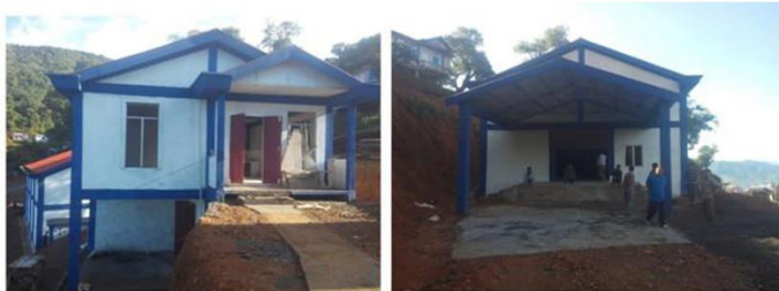
Zawngling Godown, Capacity - 350 MT Amount : Rs. 1,29,02,780.00, Under DCSO Saiha