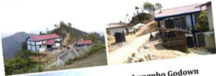
Lungpho Godown Capacity - 352 MT Amount : Rs. 1,25,55,620.00 Under DCSO Kolasib