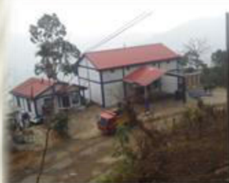
Kawnpui Godown Capacity - 250 MT Amount : Rs. 1,11,00,600.00 Under DCSO Kolasib