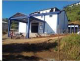
Bualpui NG Godown Capacity - 250 MT Amount : Rs. 1,16,82,060.00 Under DCSO Saiha