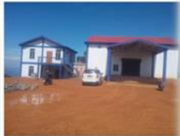
Laki Godown Capacity - 250 MT Amount : Rs. 1,17,87,780.00 Under DCSO Saiha