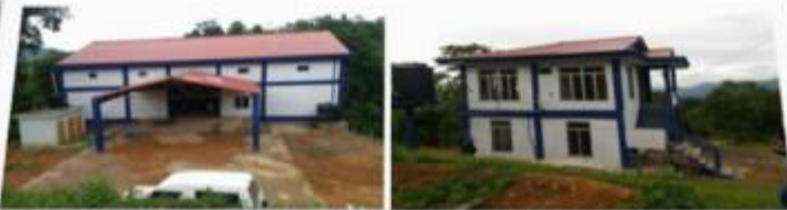
Bunghmun Godown, Capacity - 350 MT Amount : Rs. 1,26,71,340.00, Under DCSO Serchhip