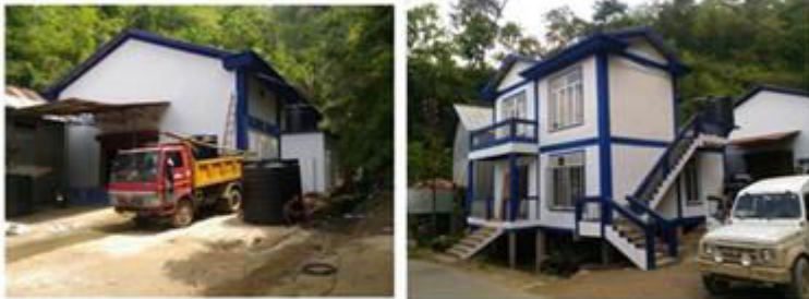
West Phaileng Godown, Capacity - 350 MT Amount : Rs. 1,21,50,600.00, Under DCSO Mamit