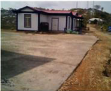
Sialhawk Godown, Capacity - 350 MT Amount : Rs. 1,25,55,620.00, Under DCSO Champhai