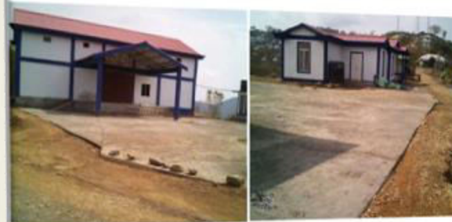
Sialhawk Godown, Capacity - 350 MT Amount : Rs. 1,25,55,620.00, Under DCSO Champhai